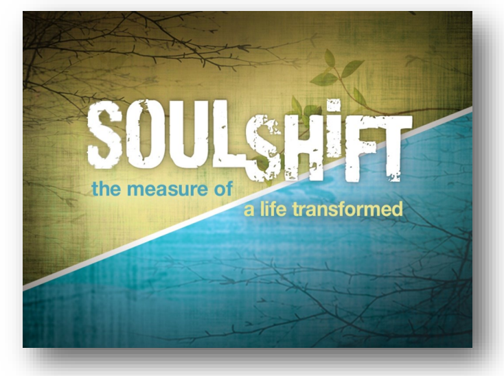
February 19, 2023